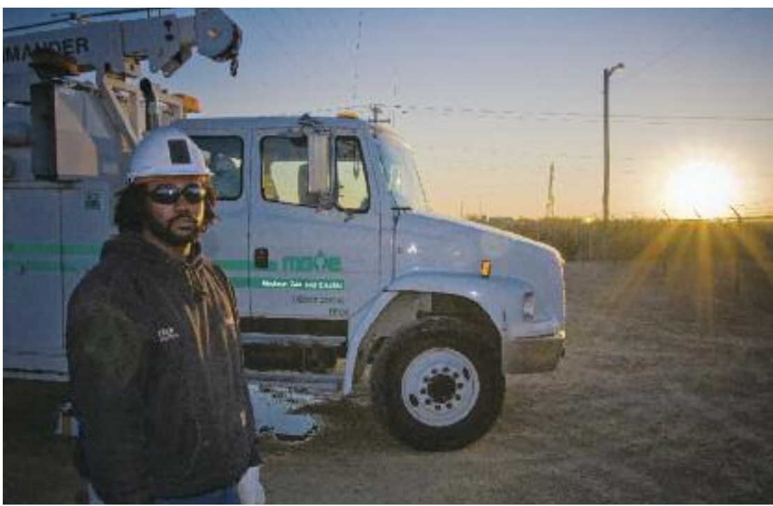
Fourteen linemen were hired above predicted staffing levels at Madison (Wis.) Gas and Electric after Local 2304 pushed for work force planning to be part of the utility's required energy assessments.

tility local leaders and members who are sick of too much talk and too little action on the glaring need to replace hundreds of thousands of retiring workers now have a potent new tool to grab the attention of employers and public officials.