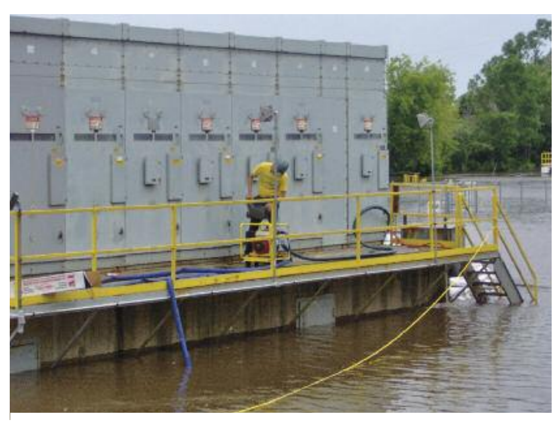
A Cargill employee pumps water out of a high voltage switchgear at the Cargill corn processing plant following massive flooding in 2008. More than 250 IBEW members worked to revive the plant.

Hundreds of local members were joined by 800 travelers to resurrect Cedar Rapids' industrial plants—including Quaker Oats and agriculture giant Cargill—and reenergize the city's only salvageable 225-megawatt power plant. It was dirty, dangerous work. Floodwaters were rife with chemicals and bacteria, and underground wire in nearly